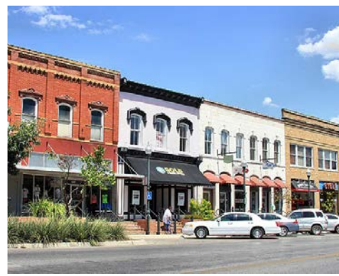
Downtown San Marcos