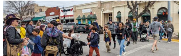
Crosswalk at LBJ Drive and San Antonio Street