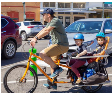
Family biking on Guadalupe Street