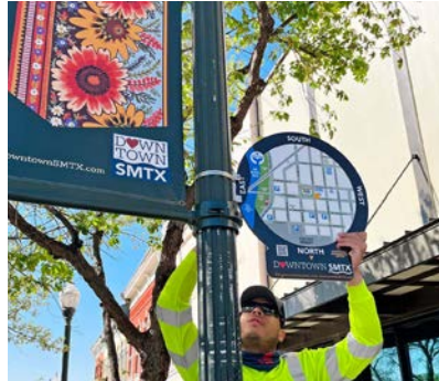
City staff installing wayfinding signs