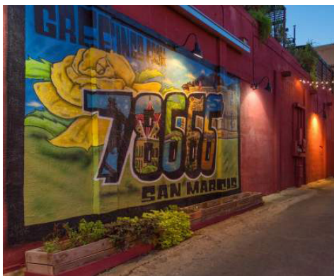
78666 Mural, Kissing Alley